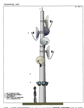
HEST, 6 SATELLITESSCHÖSSELM,6 auberrauntaugliche MONITOR-RITERPFEN mit je e bioterleuchteten Diamositis einer tunischen STADTRASICHI der 6 Partherstädt